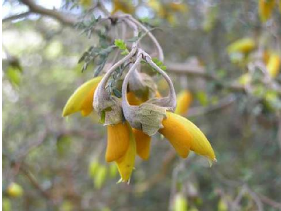
Above: Flowers of prostrate kowhai ( Sophora prostrata ), one of the native shrubs remaining (only just) on the plains. Below: Tumble lichen ( Chondropsis semiviridis ), a free-living native lichen characteristic of dryland biodiversity, seen here in the litter beneath exotic pine trees.