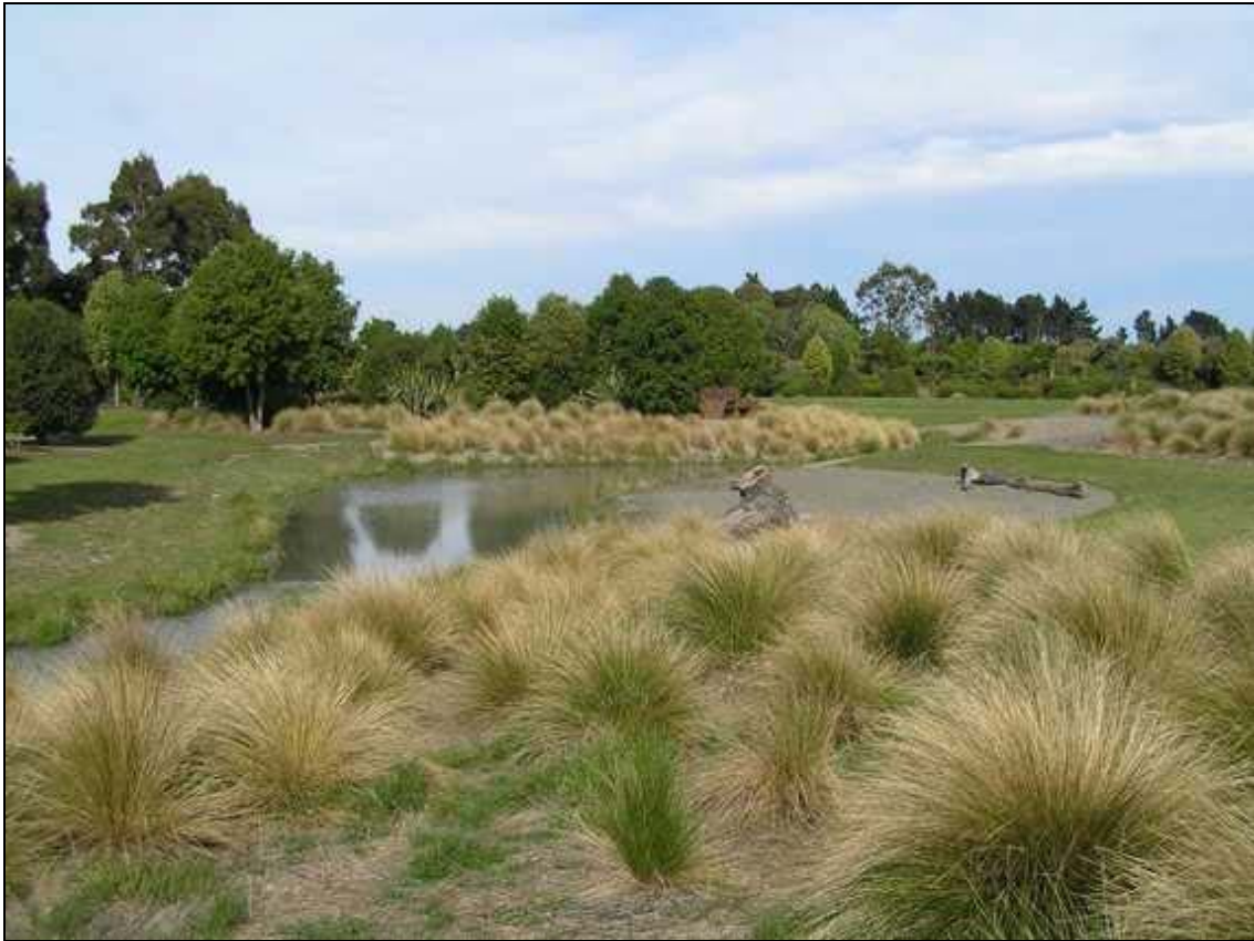
Yaldhurst Bush, initiated as a Beautiful NZ planting project in the 1980s; now managed by Christchurch City Council